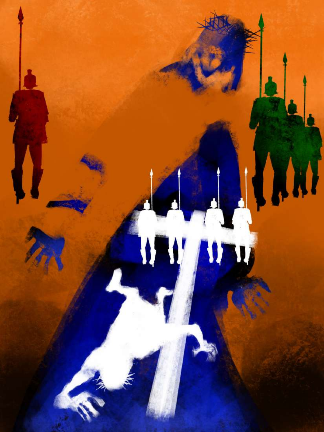
STATION NUMBER NINE