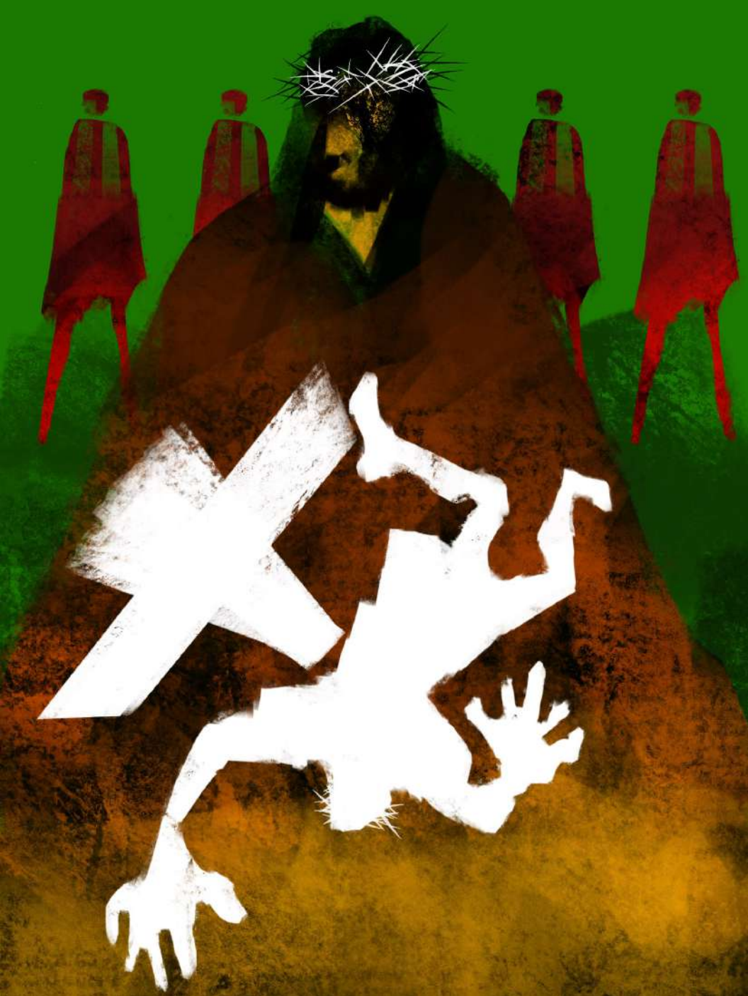
STATION NUMBER SEVEN