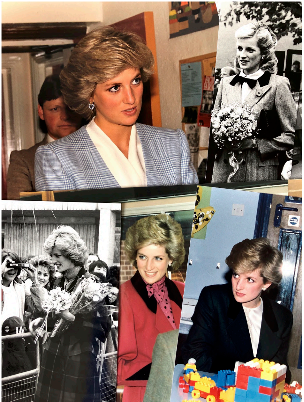
H.R.H Diana Princes of Wales