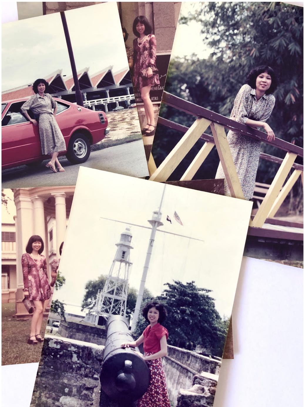
B in Penang 1978 / 79