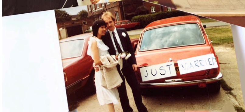
September 1st 1981 - Barkingside Registry Office