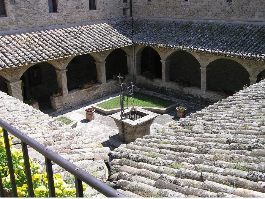
Top: Assisi Bottom: Church of San Damiano - Cloisters