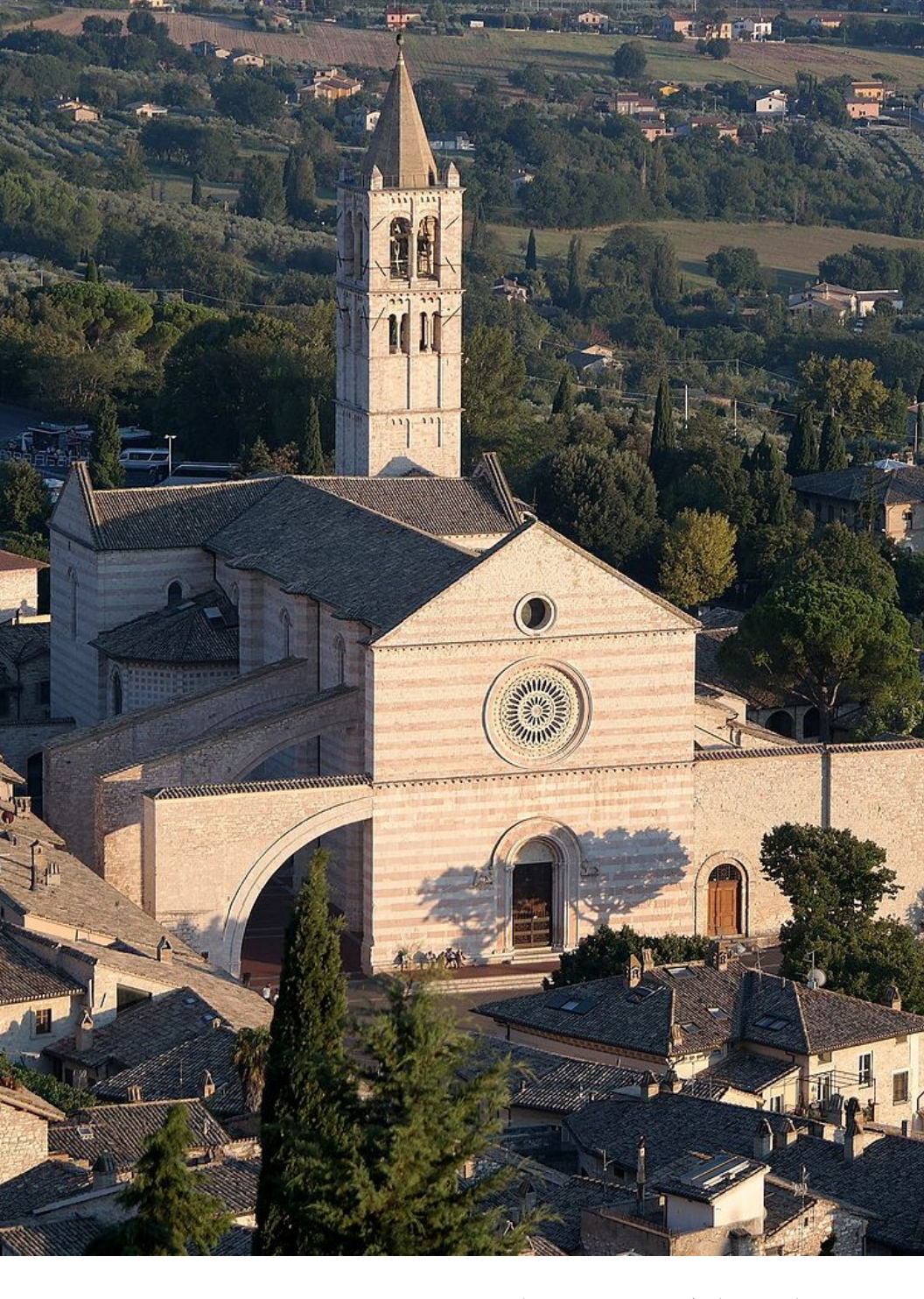
Supporting Free Reading Worldwide