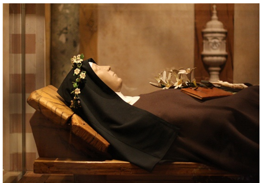
Top: Basilica of Saint Clare Bottom: Saint Clare's body in the Basilica Crypt